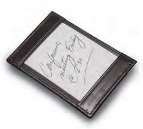
Note Holder & Cards LG 4207 Black Shell Cordovan LG 4208 Color 8 Cordovan