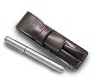
Pen Case LG 3707 Black Shell Cordovan LG 3708 Color 8 Cordovan