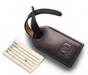
Briefcase Tag LG 1207 Black Shell Cordovan LG 1208 Color 8 Cordovan