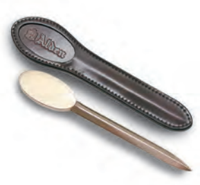
Letter Opener & Sheath LG 5207 Black Shell Cordovan LG 5208 Color 8 Cordovan